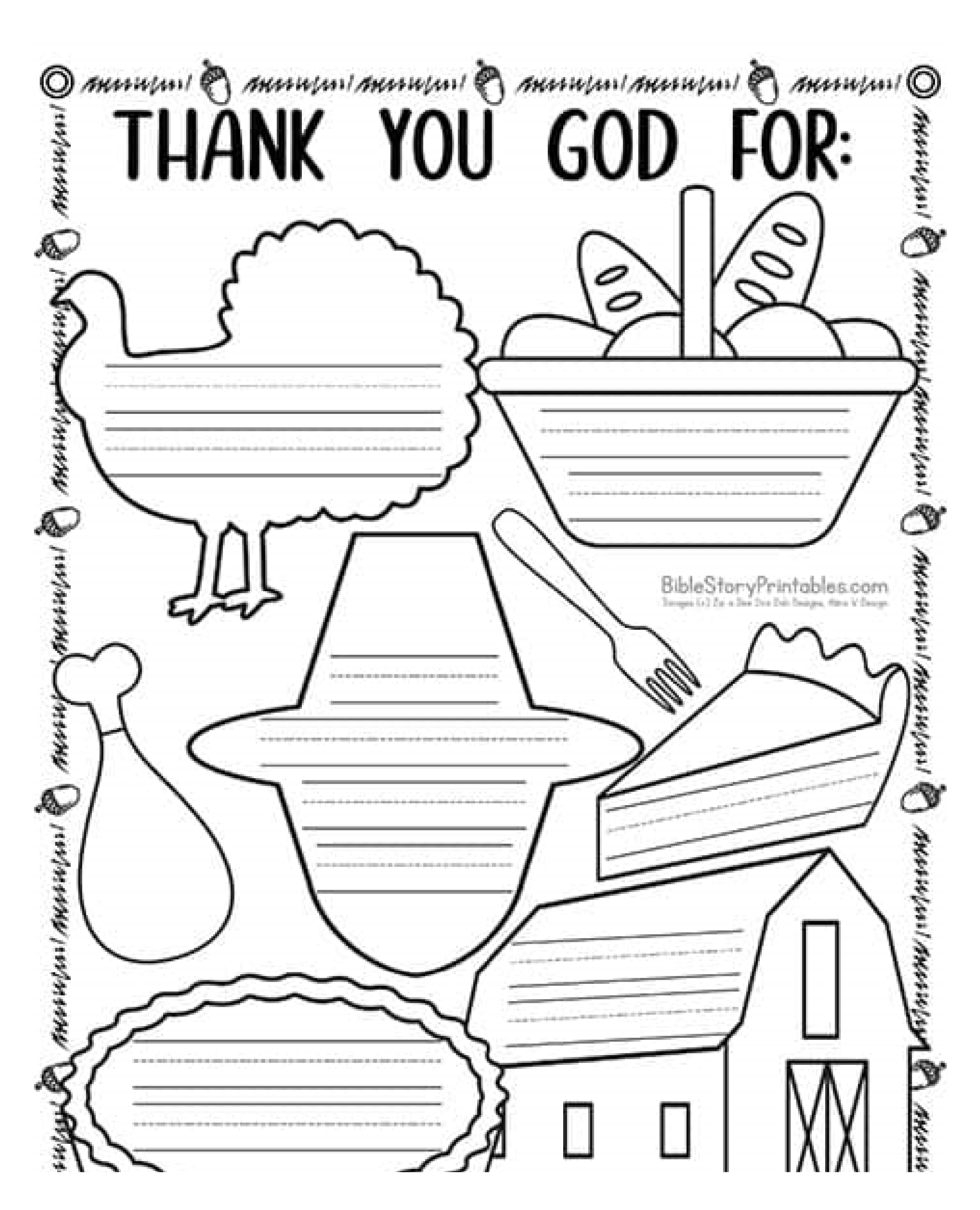
Luther Memorial Church // LMCQuincy.org // 12th & Jersey St., Quincy, IL