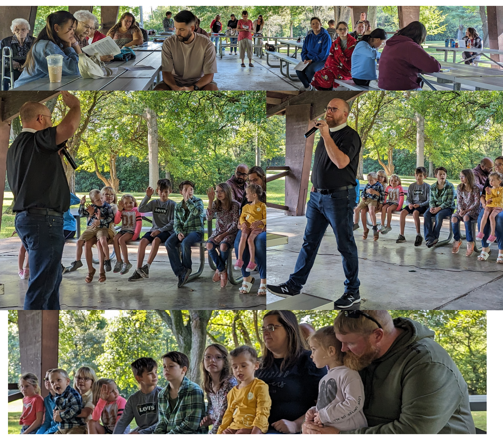
Luther Memorial Church // LMCQuincy.org // 12th & Jersey St., Quincy, IL

On September 24, the congregation of Luther Memorial Church gathered at Wavering Park for outdoor worship and carry-in lunch. More than 50 people were in attendance! It was a beautiful morning of praise to God and fellowship.